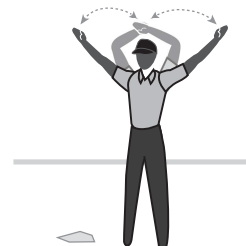
The Run Does Not Score Cross both arms back and forth above the head with palms forward. Verbalize "No Run."