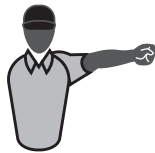
Delayed Dead Ball Extend left arm straight out in a fist with fingers facing out.