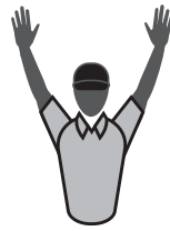
Time Raise both arms above head, palms forward, with arms at a slight angle from the body. Verbally call "Time."