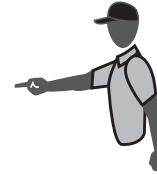
Point Extend arm with index finger extended. Keep other arm close to body.