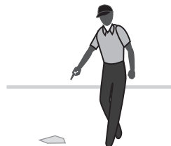
The Run Scores Point at plate while emphatically verbalizing "The Run Scores."