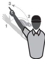
Ejection Hold up right arm with palm open and forward. Draw the hand back to the ear and redirect arm skyward at a 45-degree angle away from the body with the index finger extended.