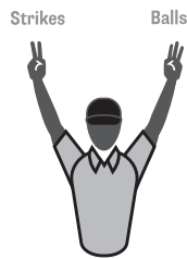
Count Raise both arms shoulder high or higher in front of the body. Indicate strikes with fingers on right and balls on the left hand.