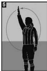
5 Wind-up to start clock