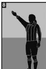
8 Corner kick (Point to corner)