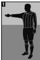
1 Direct free kick (Point in direction of kick)