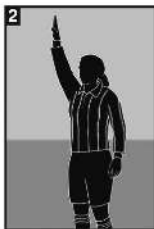
2 Indirect free kick