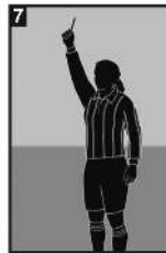
7 Caution/ Ejection