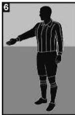
6 Penalty kick (Point to spot) Goal Kick (Point to goal area)