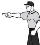
POINT Extend arm with index finger extended. Keep other arm close to body.