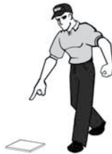
THE RUN SCORES Point at plate while emphatically verbalizing "The Run Scores."