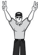
COUNT Raise both arms shoulder high or higher in front of the body. Indicate strikes with fingers on right hand and balls on the left hand.