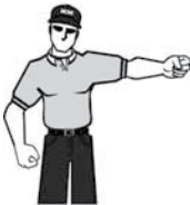
DELAYED DEAD BALL Extend left arm straight out in a fist with fingers facing out.