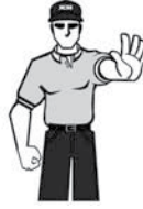
DO NOT PITCH With palm up, raise hand toward pitcher.